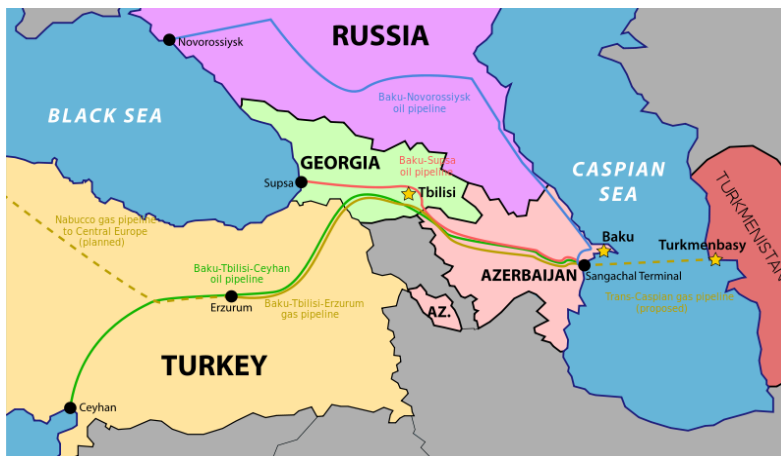
Figure 1: Existing and Planned Oil and Gas Pipelines from Baku

Indeed, although the recent construction of pipelines and transport routes – such as the Baku-Tbilisi-Ceyhan (BTC) and Baku-Supsa oil pipelines, the Baku-Tbilisi-Erzurum (BTE) natural gas pipeline, and the soon-to-be-completed Kars-Tbilisi-Baku railway – have raised the importance of the South Caucasus as an energy supplier and transit region, Armenia has been excluded from benefitting from these ever-important East-West transportation and communication routes through the region. As a result, Yerevan has seen its national economy grow by an annual average of just 5.7% since 2005 compared to 16.0 % in Azerbaijan and a Caucasus and Central Asia (CCA) regional average of 8.3 % (World Bank). 27 This has led to significant population loss as Armenians relocate to Russia and the West in search of better economic prospects. After registering a steady increase all through the Soviet period, the population of Armenia declined from 3.604 million in 1991 to 3.100 million in 2011 (World Bank).