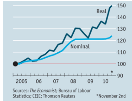
Figure 1: China's yuan-dollar exchange rates

It is also important to note the changes in real exchange rates over time. Inflation is higher in China than in the US, which is, in effect, also an appreciation of the RMB relative the U.S. dollar. Given the same time period above but accounting for inflation, the RMB actually appreciated 7.0 percent in real terms, instead of only 5.7 percent. Figure 1 captures well this increased gap between nominal and real exchange rates. The high inflation can be attributed to the excess liquidity in China due to its stimulus package.